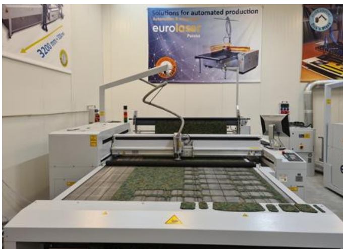
Image 2: Laser processing of cordura – prototype production of military uniforms