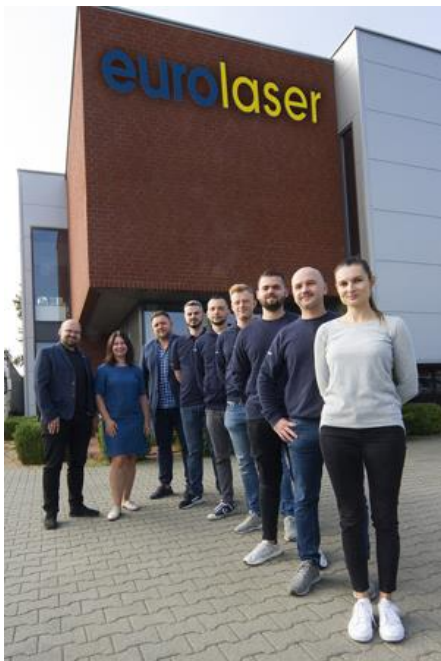
Image 1: The eurolaser Polska team in front of the company headquarters

In 2015, eurolaser Polska was integrated as an authorized partner of eurolaser GmbH, being responsible for sales and technical support for the vendor's laser systems in the territory of Poland.