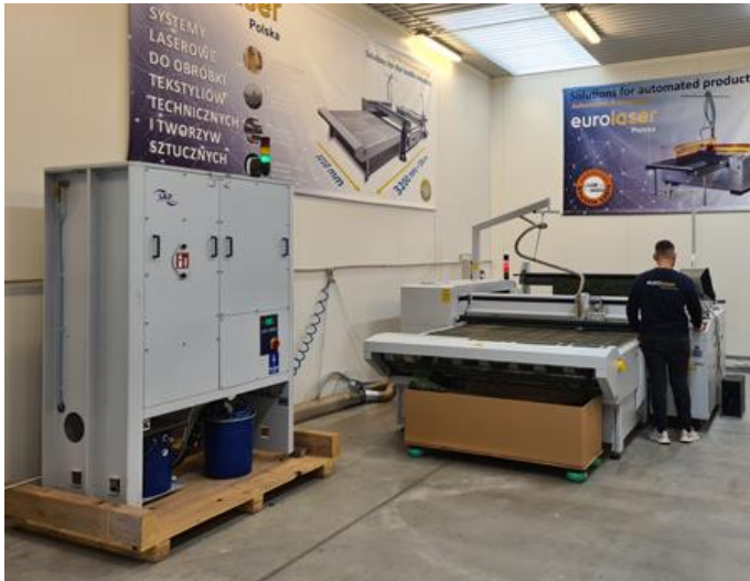
Image 3: The LAS 800 laser fume extractor (left) purifies air from laser fume and dust

“We were looking for very flexible laser fume filtration unit, because the range of different kinds of materials described as technical textile is very wide and depends on market sector. We are cutting different kinds of materials and their sandwich combinations which generates different types of laser emissions. Laser fume must be removed quickly and effectively so that it does not affect the contamination of the machine and product, and for the health of people operating the laser cutter,” explains Mariusz Deptuch.